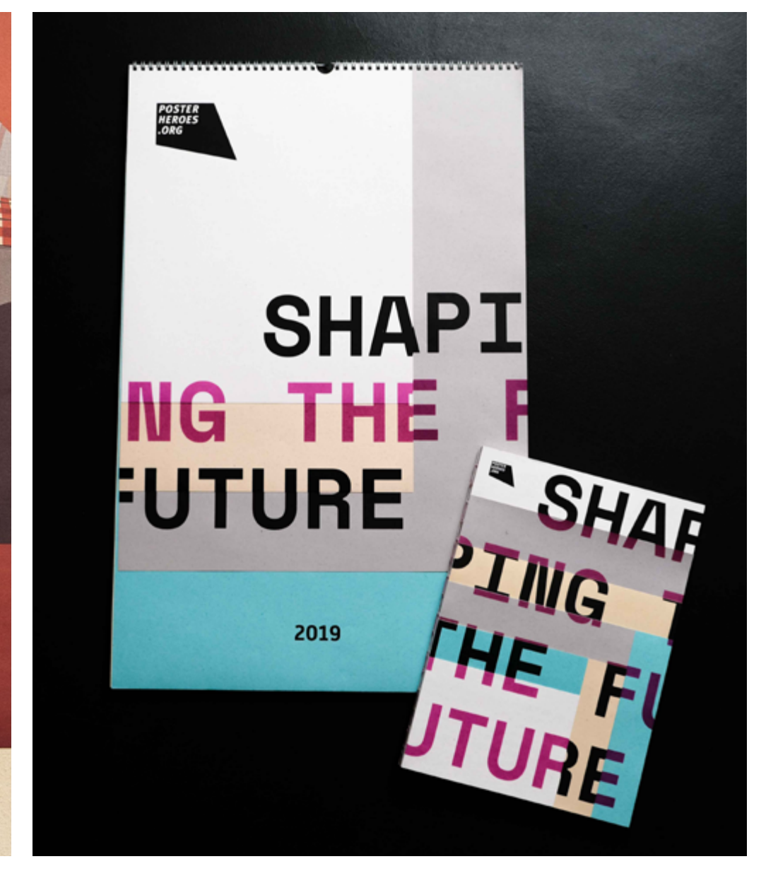
Posterheroes Exhibition, Poormanger, Turin, 2017