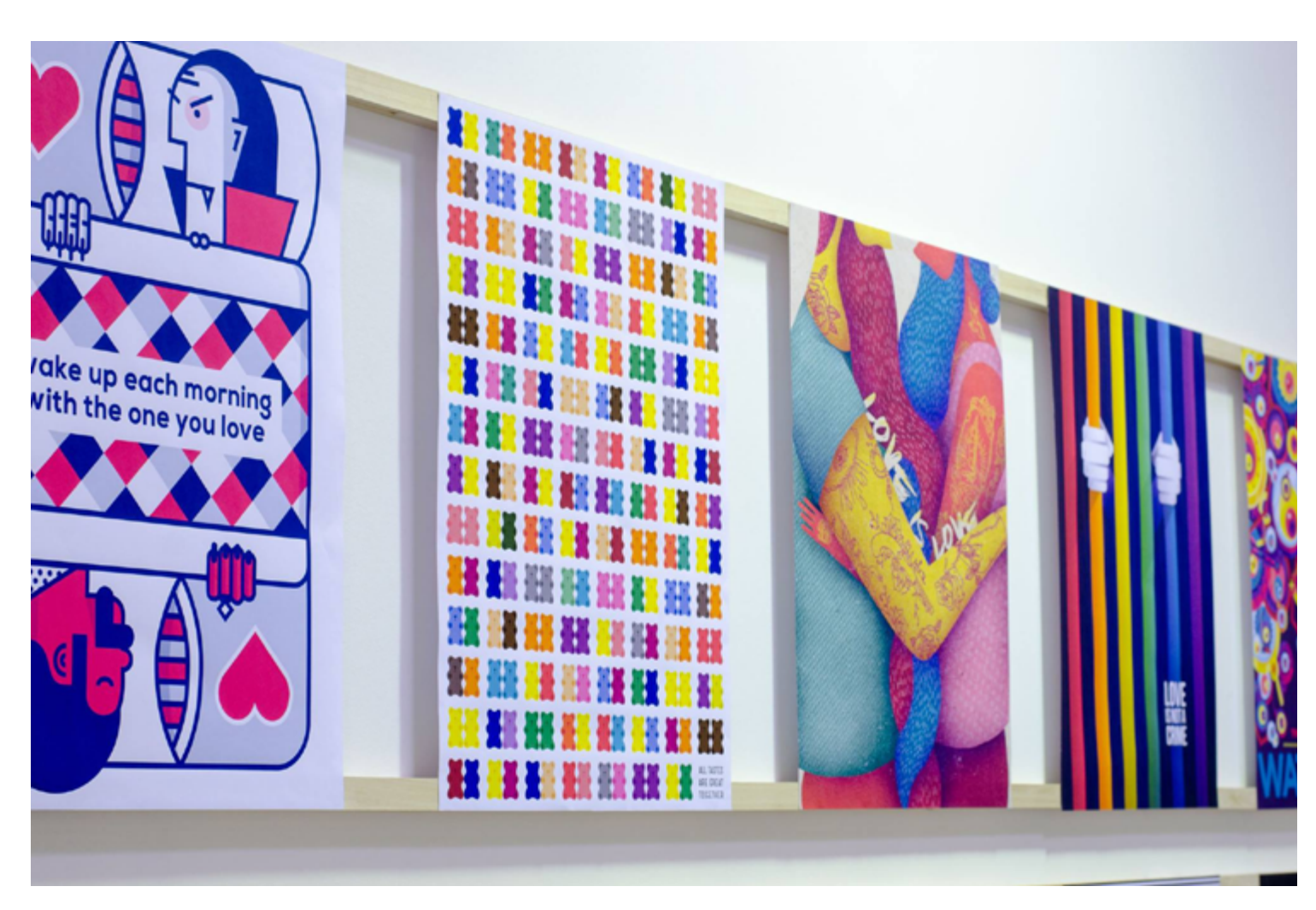
Posterheroes Exhibition, Torino Graphic Days, Toolboox Coworking, 2016